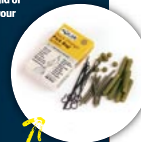
You get clips, beads, shrink tubes and buffer beads.

You can buy Quick Change PVA bag clips in all Solar's Debris colours to match the lakebed you are fishing. You get eight clips, plus beads and rubber inserts, per pack.