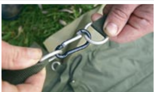
Clipping the tension strap together. This puts the poles under pressure to give the bivvy its shape.