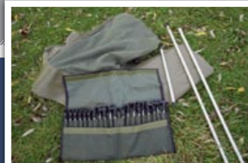
Groundsheet, big front mozzie mesh panel, tension bars and pegs are all included in the package.

For more information visit www.chubfishing.com