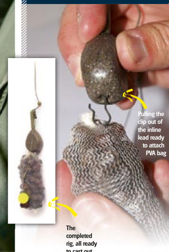
The completed rig, all ready to cast out.

Well-stitched pegging points have a bungee for added tension.